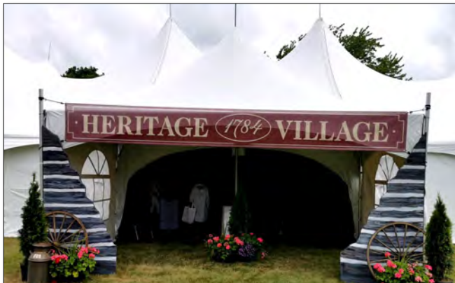
A large tented area of displays from numerous groups including British Home Children, St. Lawrence Branch UELAC, Fille du Roi; in person presentations and more.

The City of Cornwall, Ontario will be celebrating the 240th Anniversary of its founding with a special re-enactment event.