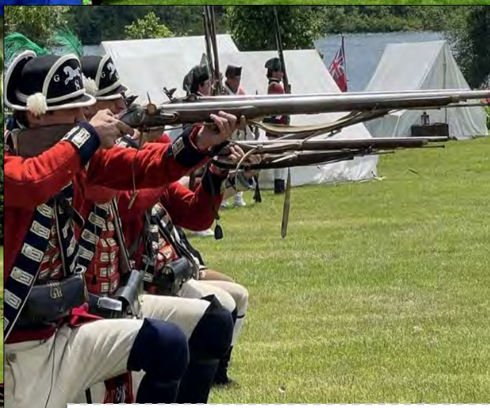
Lamoureaux Park - Military encampment; parade of re-enactors; Landing of a large bateau, large crowd to participate in the drawing of lots, firing a salute. The rain that finally arrived did not deter anyone.