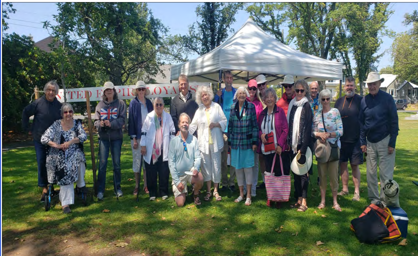
The photographer is always missing from the shot. Good turnout.

Look at all the smiling faces. Great day and nice weather.