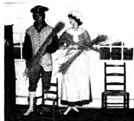
Shelburne Museum

Look for this book at the Chilliwack Library, call number 971.625 ACK. It was an unexpected and most enjoyable find. It deserves a full bell salute.