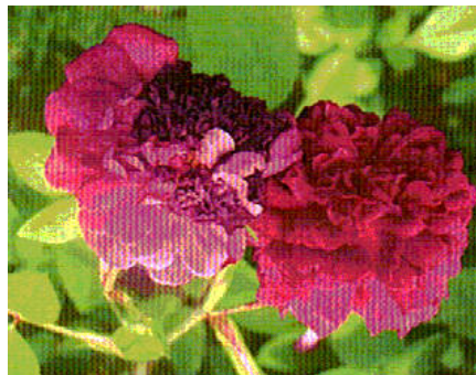
The Lawrence Loyalist Rose