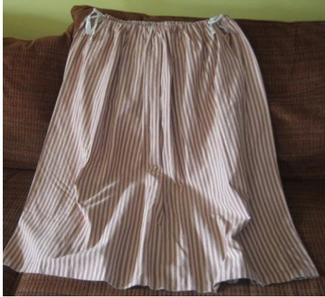
Pink and beige striped drawstring skirt