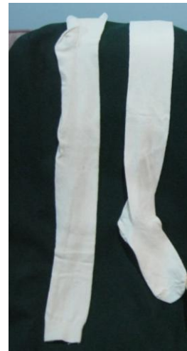
Long neutral colour stockings, elastic top