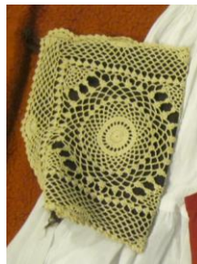
Drawstring bag, maroon with beige lace overlay