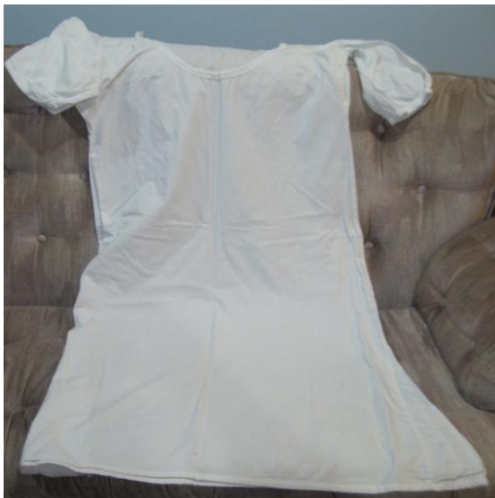
Floor length shift, white to wear under dress or skirt