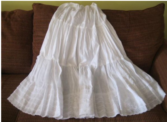
White cotton underskirt with elastic waist 40" waist or smaller