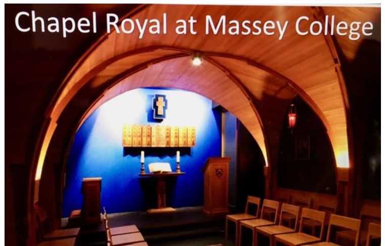
Interior of St Catherine's Chapel Royal at Massey College