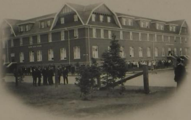
THE ORIGINAL MOUNT ROYAL COLLEGE BUILDING, CA. 1912