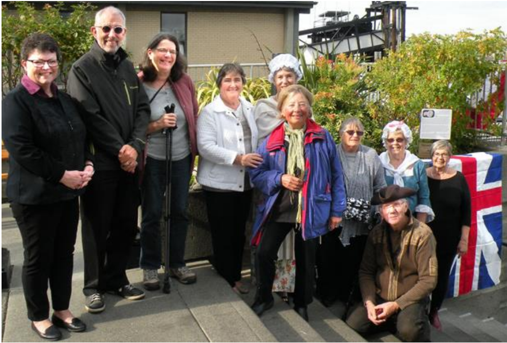
Victoria Branch Executive at the Loyalist Rose Garden.