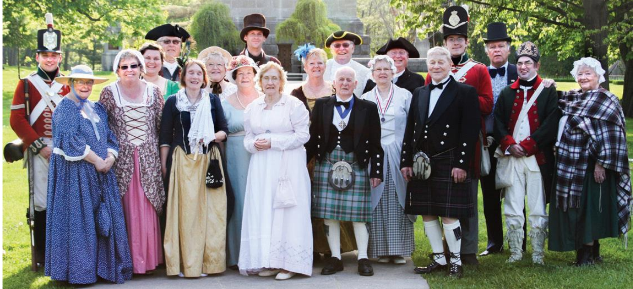
Following the Gala 2014