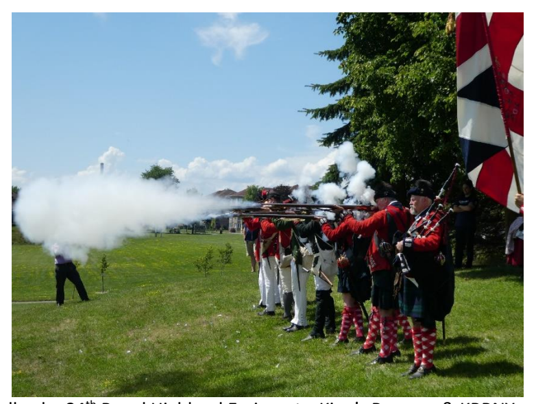
Musket volley by 84<sup>th</sup> Royal Highland Emigrants, King's Rangers & KRRNY re-enactors